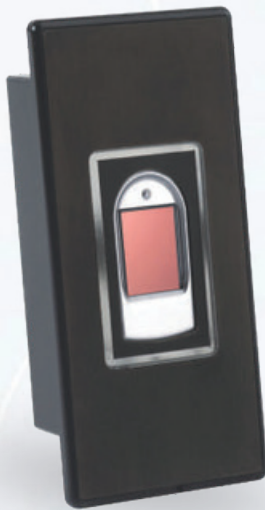
Touchkey Fingerprint Reader - BL