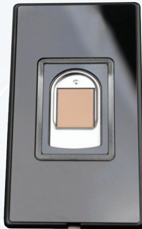
GlassLine, A Glass Cover Plate