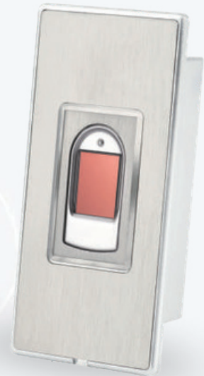
Touchkey Fingerprint Reader - SS

A beautiful home begins with a grand entrance and a grand entrance deserves nothing less than the exquisite and discreet TOUCHKEY Finger print reader. Say goodbye to all the bulky and obtrusive fingerprint locks. The sensor uses an ID3 algorithm for biometric data processing, which is certified in the USA by the NIST National Institute and is MINEX 3 certified. Due to the high quality our readers enable safe and easy to use.